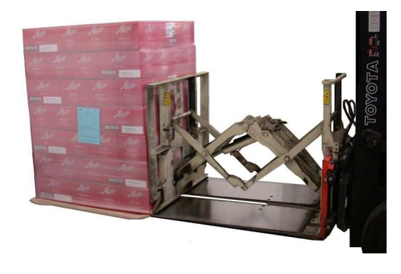
The Push-Pull System