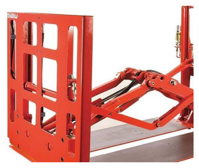
Either the Push- Pull Accessory

Both, the sending and receiving factories must have the necessary equipment for Loading & unloading: