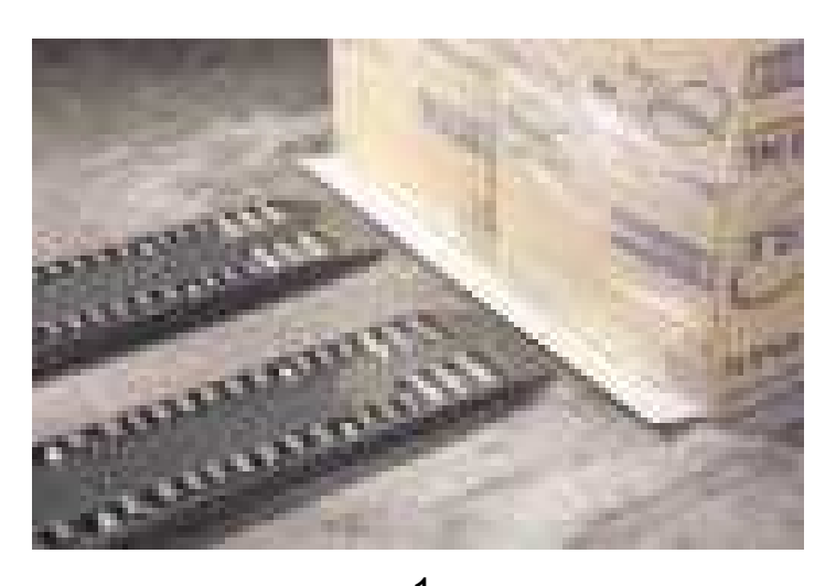
The Roller-Fork slides under the Slip-Sheet with the goods on it