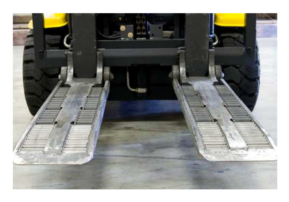
Or the Roller-Fork Accessory