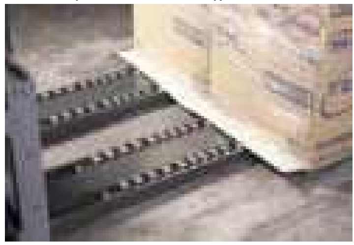
The Roller-Fork unit lifts the goods from the floor and transports them to the container